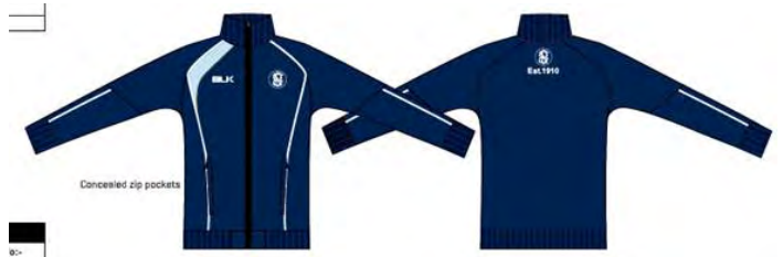
Soft shell travel jacket $70