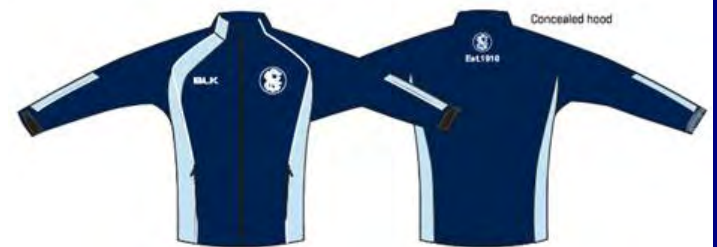
Spray jacket $70