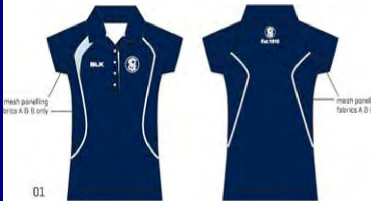
Ladies polo $35