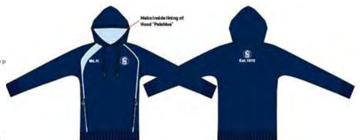
Hoodie (Adults) $70 Hoodie (Juniors) $60