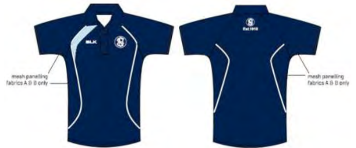
Mens Social Polo $40