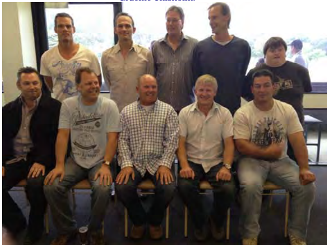
The '91/92 1st XI