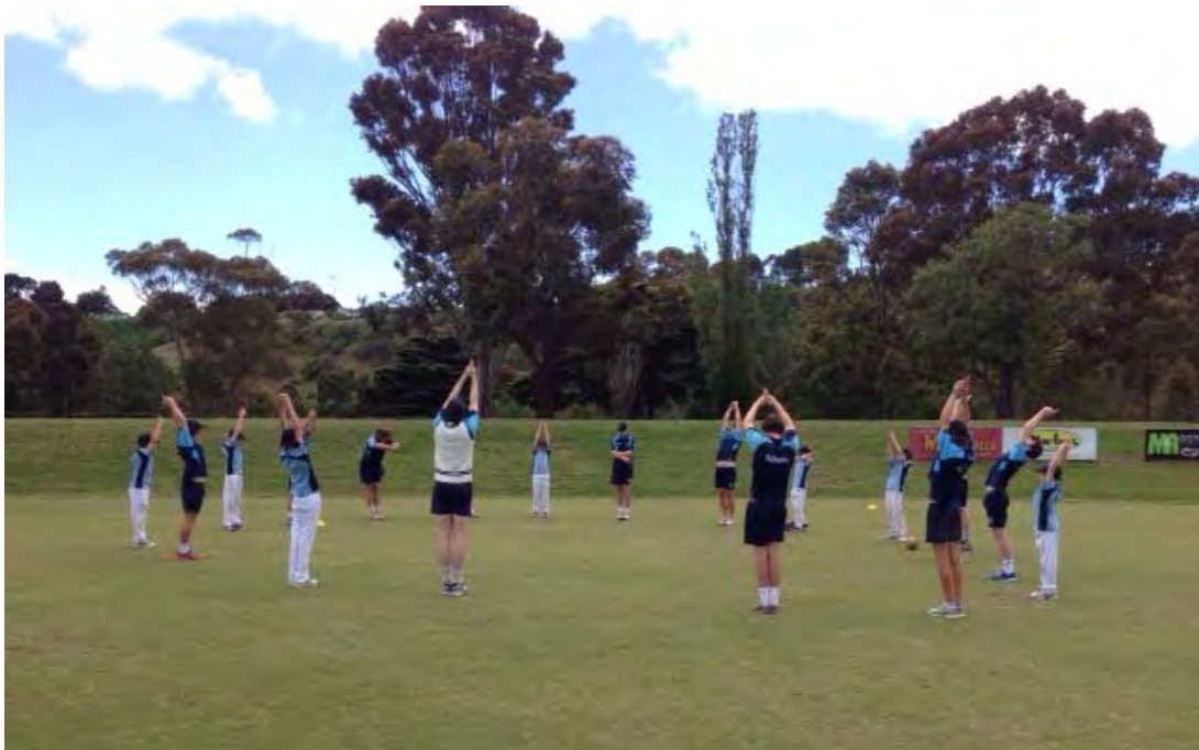
The under 13s join in with the First XI for warm up on day one against South Barwon