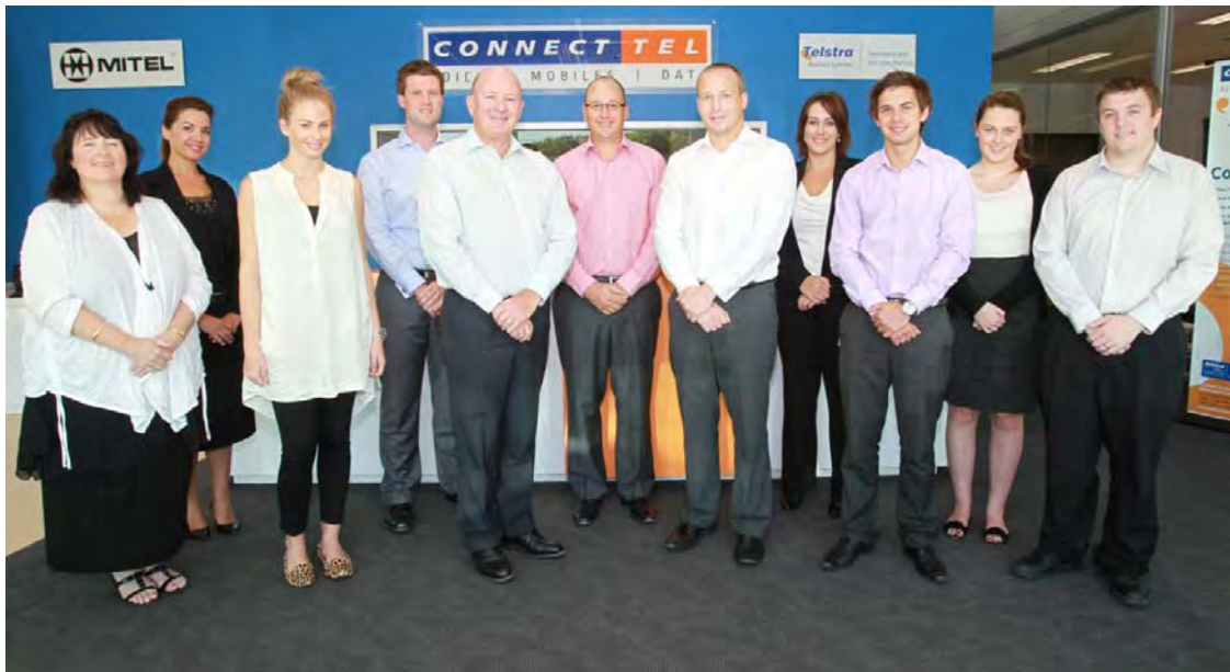
The Connect Tel team

So if you're in the market for any or all of the above, give Connect Tel a call.