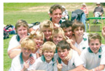
Geelong College Year 6 cricket team

Wednesday, December 14