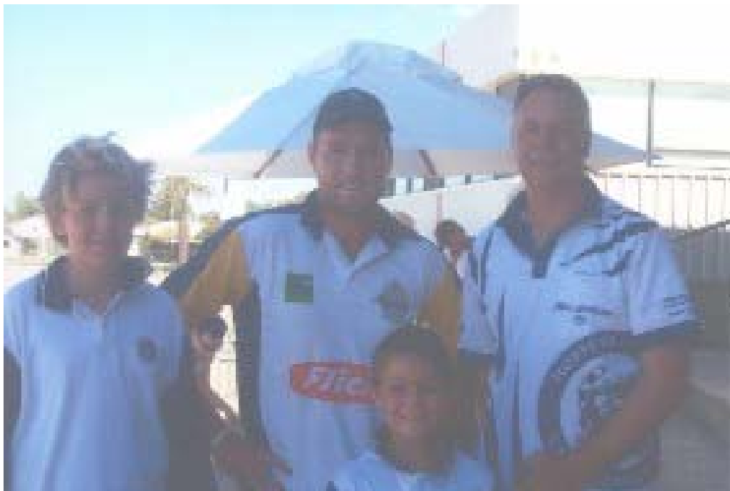
Mildura's Willowfest was enjoyed some good looking blokes from Queen's Park.