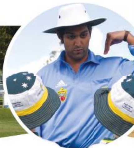
2 Well Played