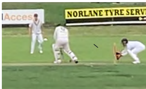
A bit fuzzy – your call!

Then the signal from the umpire that, in some parts, continued the astonishment. The blurry phone footage and the balcony choir suggested bump ball. With or without the technology of the time, arguments like this go on forever.